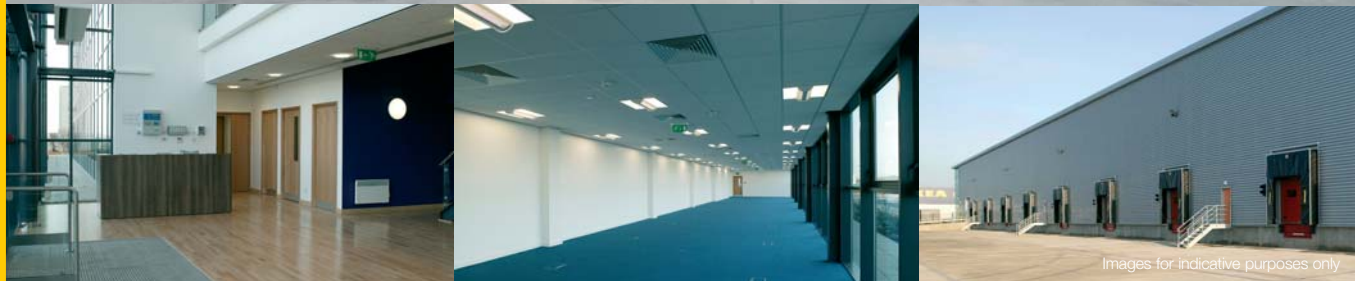
Images for indicative purposes only