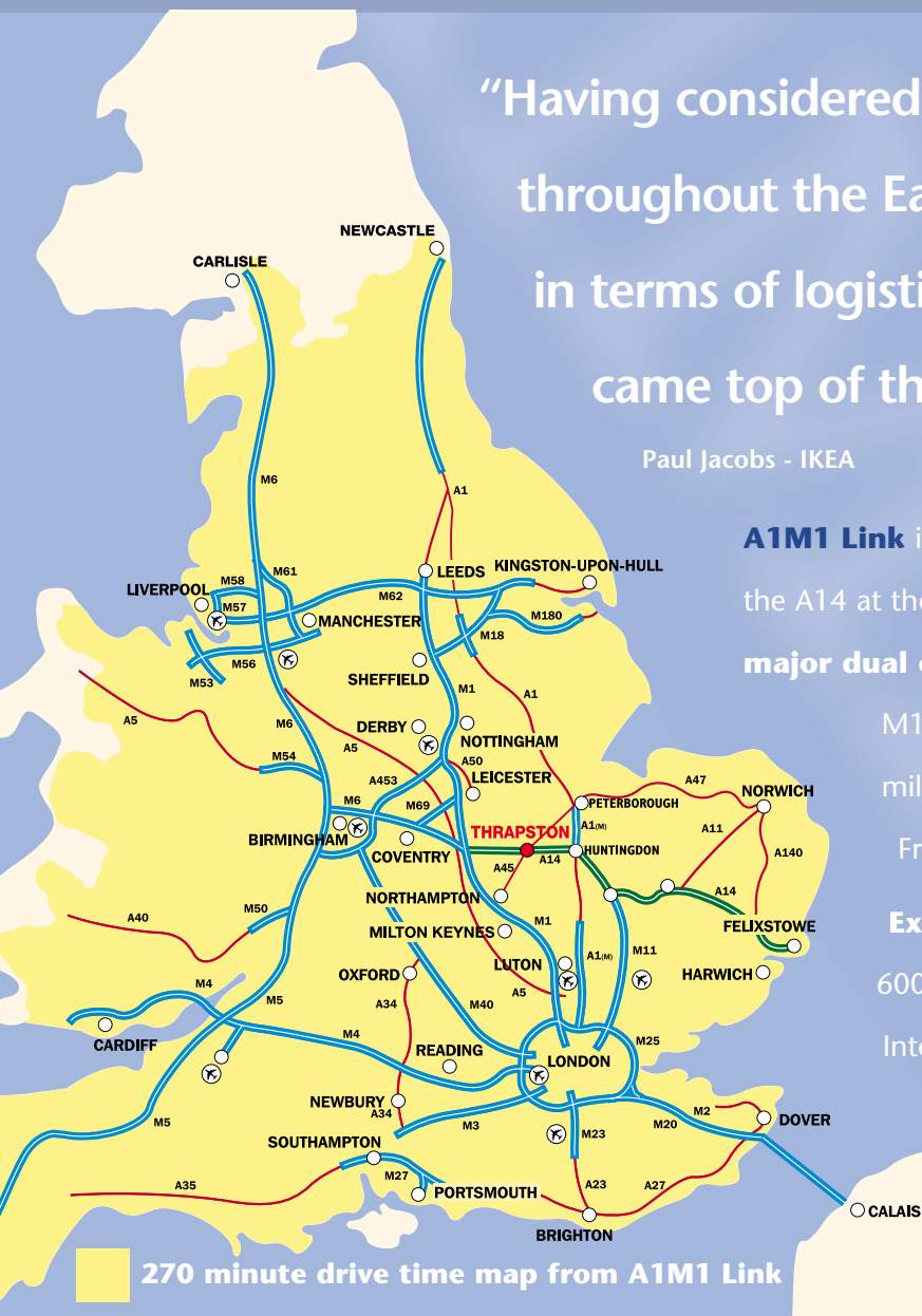
270 minute drive time map from A1M1 Link

Existing occupiers include IKEA with their 600,000 sq ft European Distribution H.Q., International Paper Containers, Superior Group Limited and ABX Logistics.